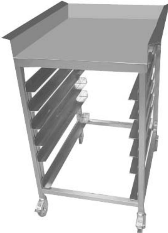
BKI's LTS shown above

Efficient and ergonomically designed mobile work station, optimal receiving platform to compliment your fried food system